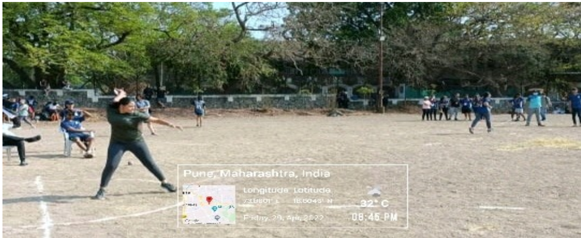
Anjali Kumawat performing her winning shotput throw for which she secured 1 st place